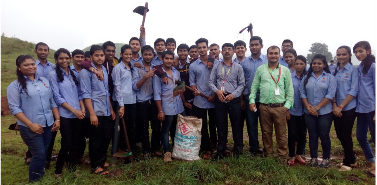
The team of tree plantation