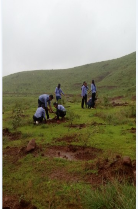
Student volunteers doing the tree plantation