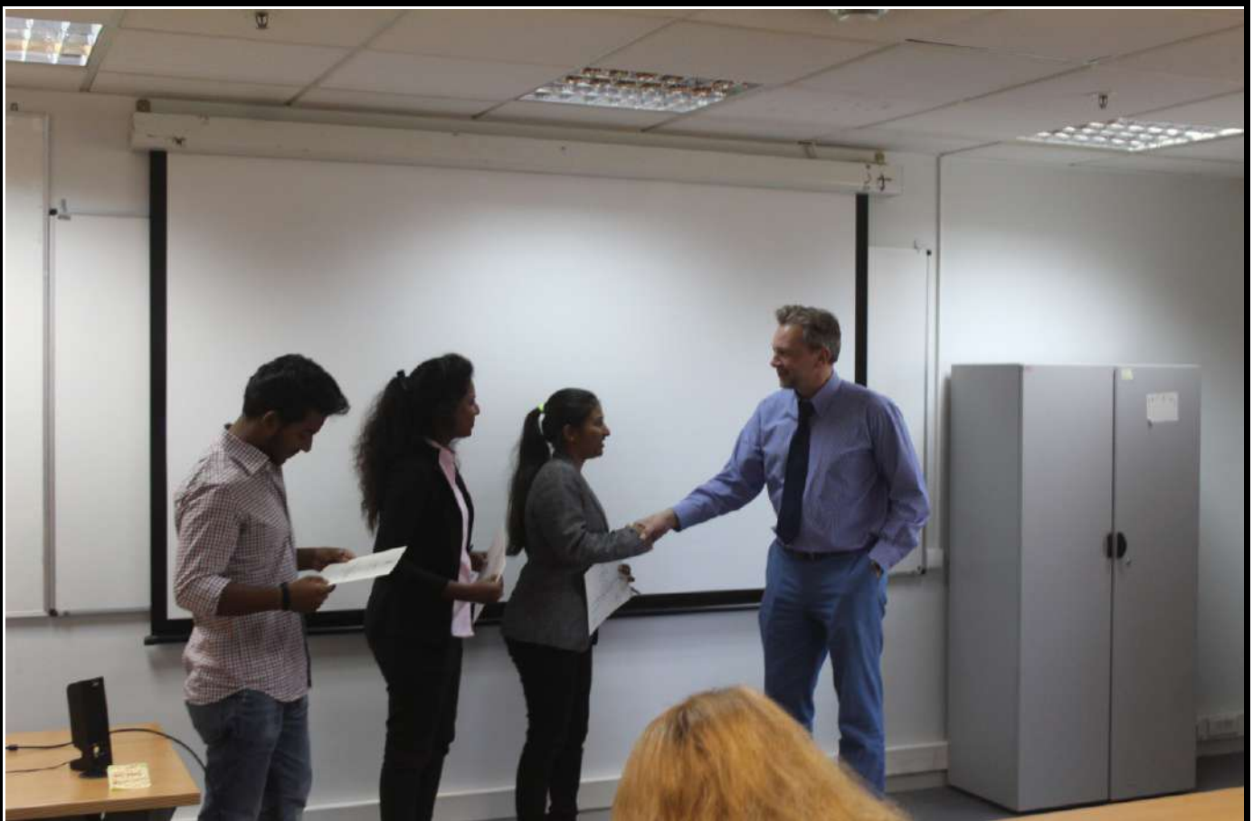
Felicitations on last day at AIT, Athens, Greece