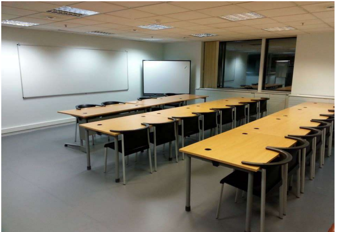
Lab and Class Room