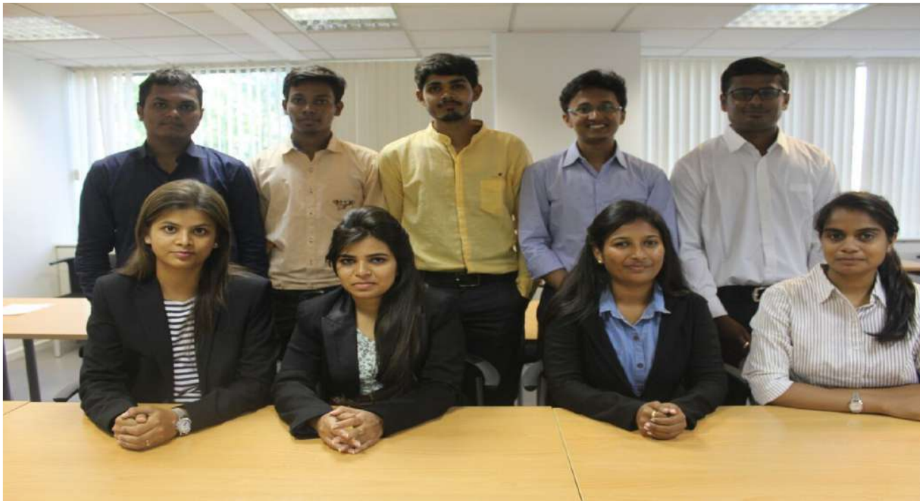
Team of Sandip Foundation in AIT, Greece