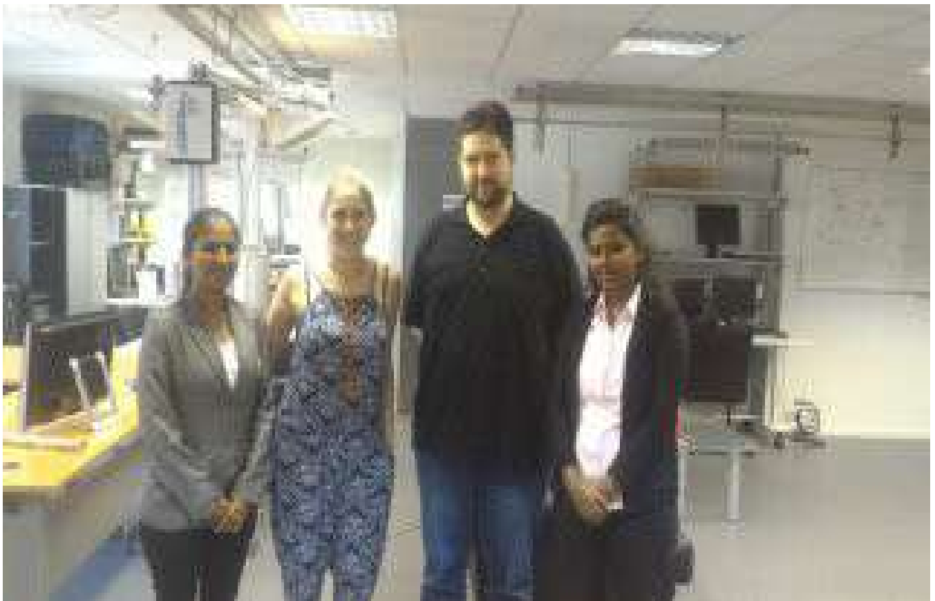
Students with their project guides