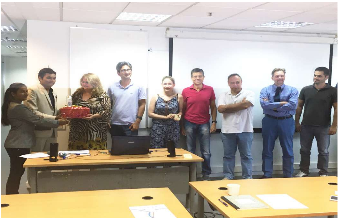
Felicitations on last day at AIT, Athens, Greece